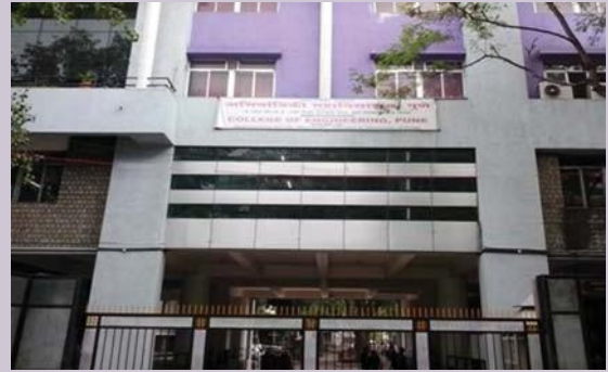
M.E.S. College of Engineering, Pune.