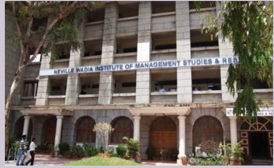
Neville Wadia Institute of Management Studies & Research, Pune.