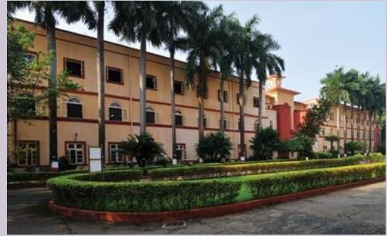
New Law College, Mumbai.