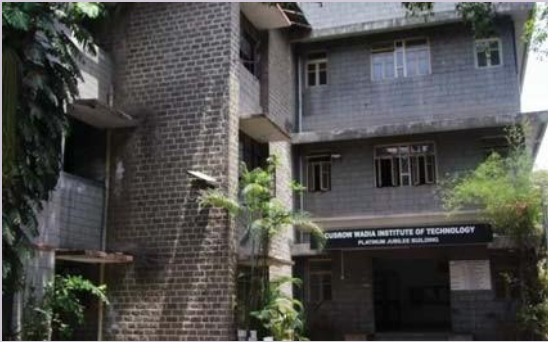
Cusrow Wadia Institute of Technology, Pune