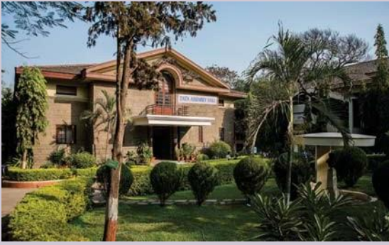
Nowrosjee Wadia College of Arts & Science, Pune.