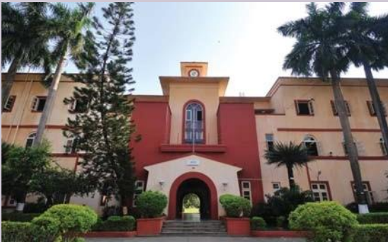
D. G. Ruparel College of Arts, Commerce & Science, Mumbai.