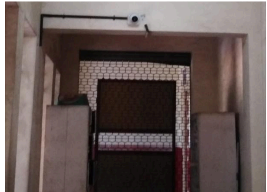
The pictures showing the CCTV cameras at different locations