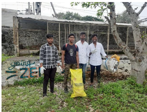
Plastic collection drive carried out on campus