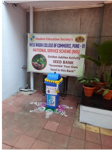
Seed collection drive carried out in college