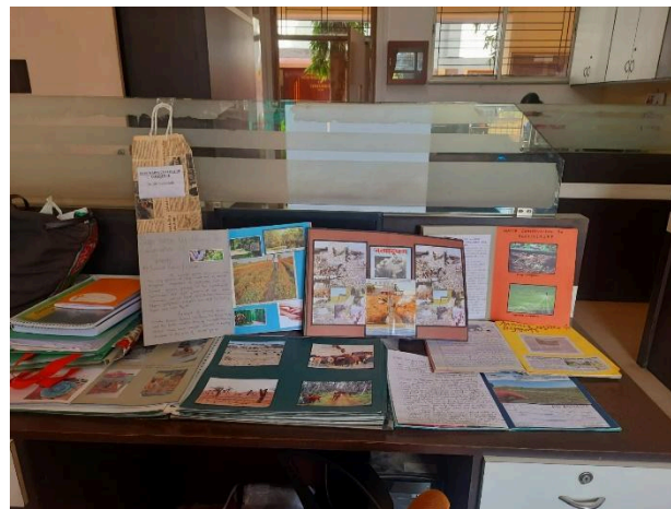
Exhibition Display done by students